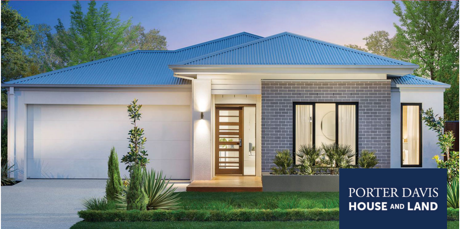
PORTER DAVIS HOUSE AND LAND