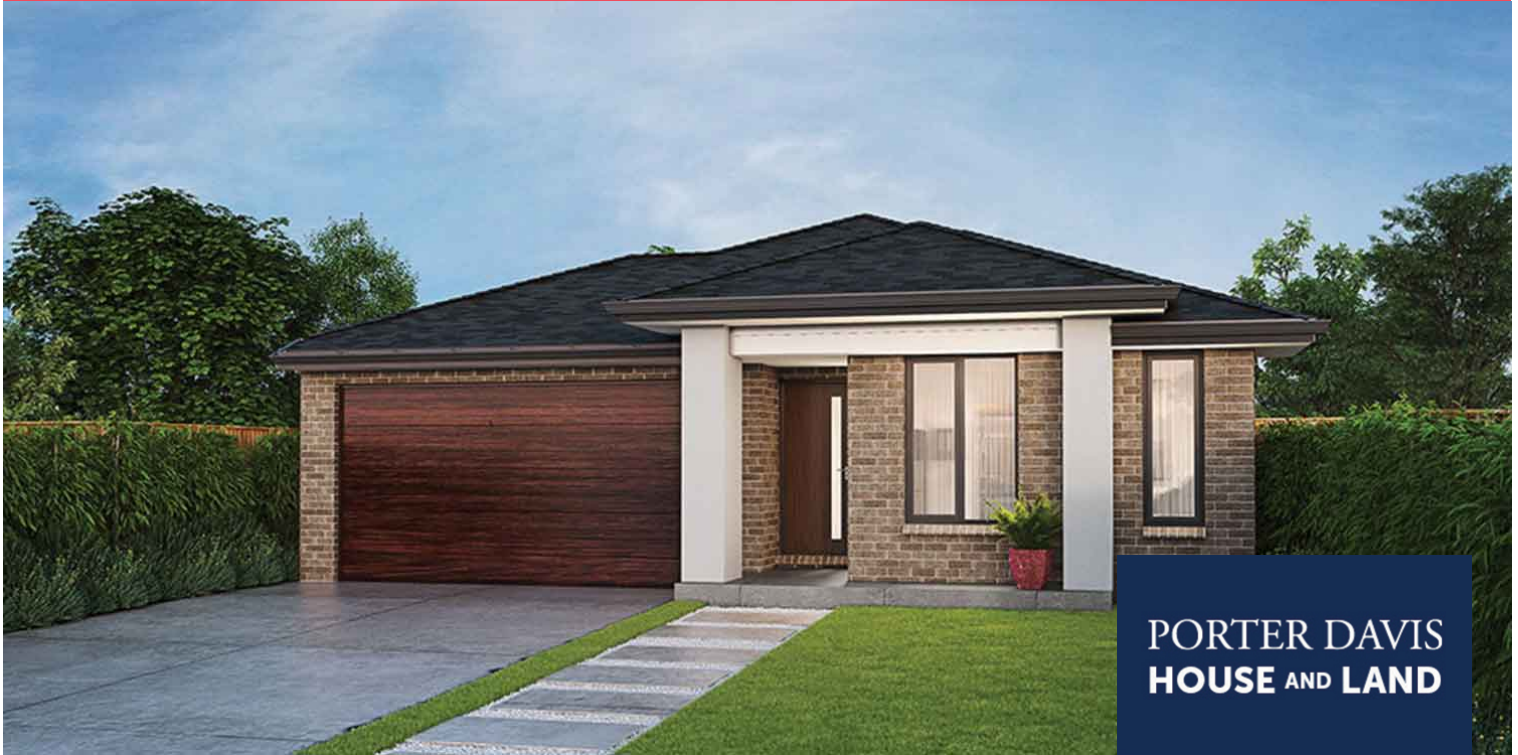
PORTER DAVIS HOUSE AND LAND